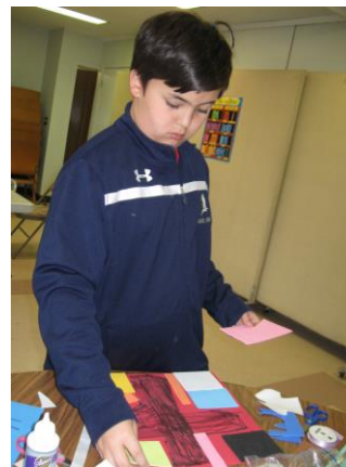
All classes, Preschool through High School, joined Faithful Families in making decorative squares which became the Palm Sunday path in the sanctuary.