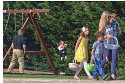
The end of a busy, but fun (!), hunt.