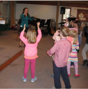
song in Opening,