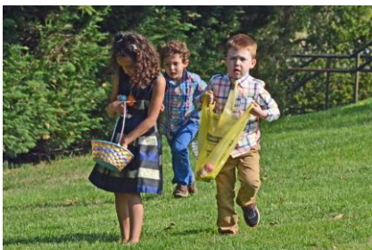
How many eggs do I have?