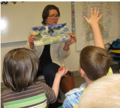
reading the Easter story in Preschool/ Kindergarten,