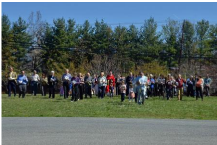
Marching in with palms on Palm Sunday.