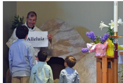
Learning what 'Alleluia' means.