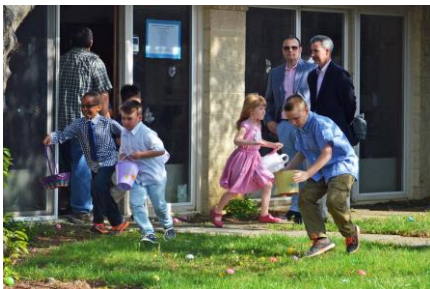
...and the race is on!