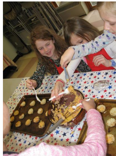
and mini quiches in Elementary classes.