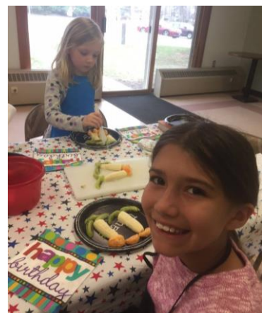
And making yummy palm tree treats