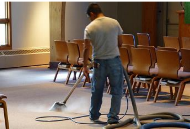
Now - this is what we call a clean carpet!