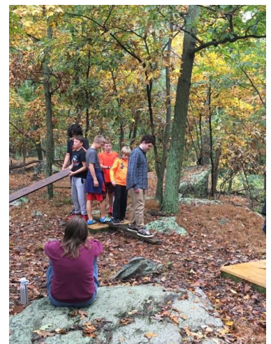
challenge course with planks