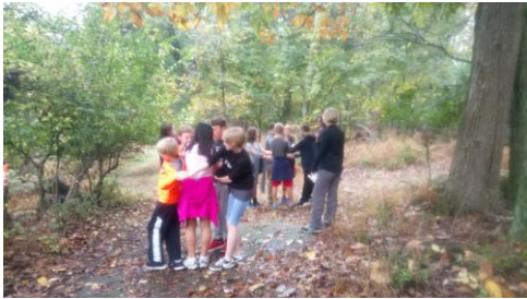
challenge course 'knot' of all kids (in 2 groups)