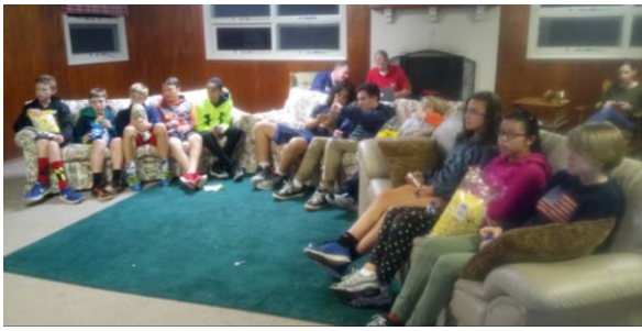
movie time with snacks