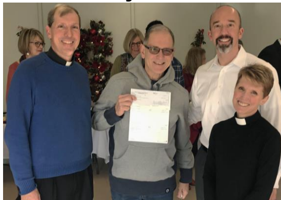
The Final Mortgage Check!