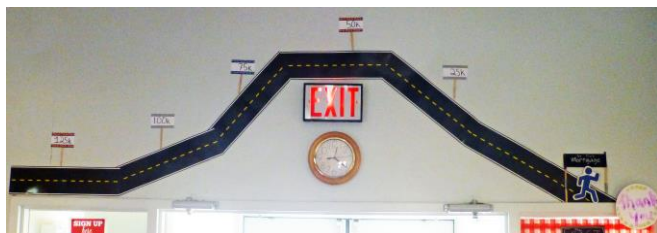
↑ The track for the race to the Feast! ↓